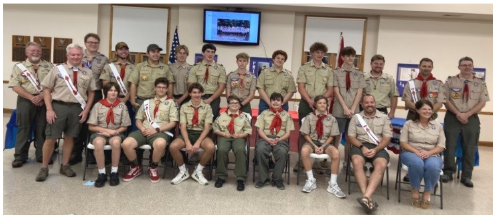
Boy Scout Court of Honor